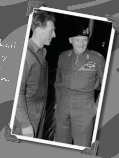
Field Marshall Montgomery of Alamein visits Enham in 1947

The EACH project is a community partnership organised by Enham, Enham Alamein Parish Council and Smannell & Enham Church of England Primary School, to explore the local heritage and raise awareness of the fascinating history of the Enham charity and Enham Alamein village, near Andover.