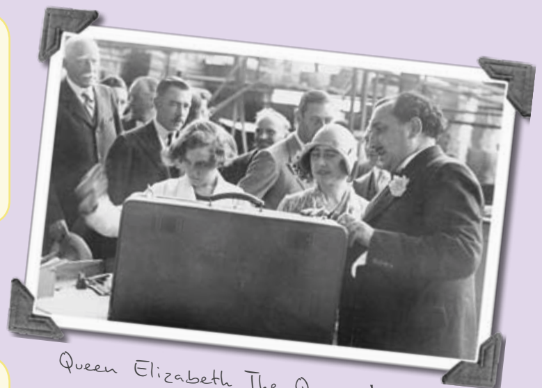
Queen Elizabeth The Queen Mother

Over the 90 years, visitors to Enham have included King George V, Queen Mary, Field Marshall Montgomery of Alamein, Queen Elizabeth The Queen Mother and our Patron HRH The Duchess of Gloucester.