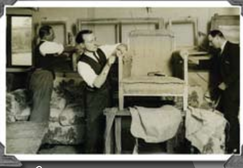
Basketmaking in the Village 1938