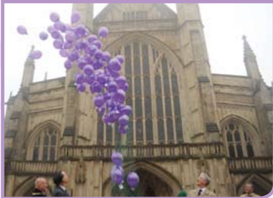
Balloon Launch at Winchester Cathedral

Over the years Enham has transformed itself from a village rehabilitation centre to a disability organisation offering a diverse range of services covering 10 counties across the UK. We have thrived by constantly adapting to the changing needs of disabled people, not forgetting the tireless support of our friends, donors and partners, including you! So a huge thank you goes to all of you.